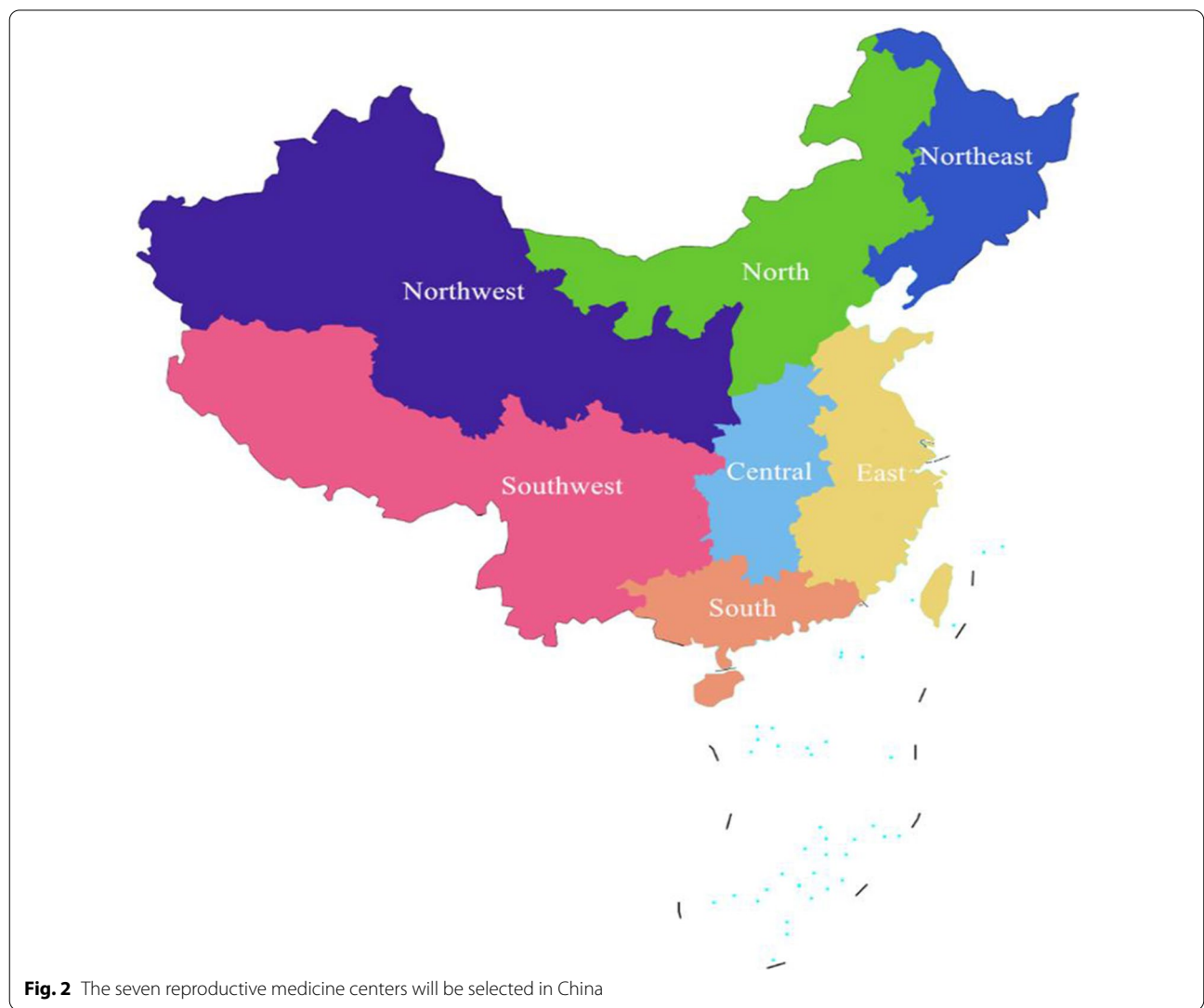
Fig. 2 The seven reproductive medicine centers will be selected in China

The systematic review will identify a wide scope of studies investigating the either disease-specific or generic quality of life of individuals with fertility problems. To identify such studies, eight databases will be searched, including PubMed, Web of Science, Cochrane Library, Embase, and including the most widely used database for articles written in Chinese, China National Knowledge Infrastructure (CNKI), WanFang Data, China Science and Technology Journal Database (CSTJ), and China Biology Medicine disc (CBMdisc). Key words included in the search strategy will include: infertility (sterility); patient-reported outcomes; quality of life